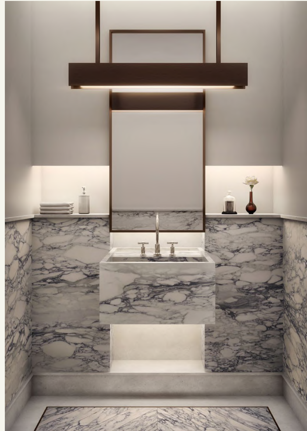
Richly contrasting natural materials, including dark wood and marble, invite a sense of tranquility in the primary bath.