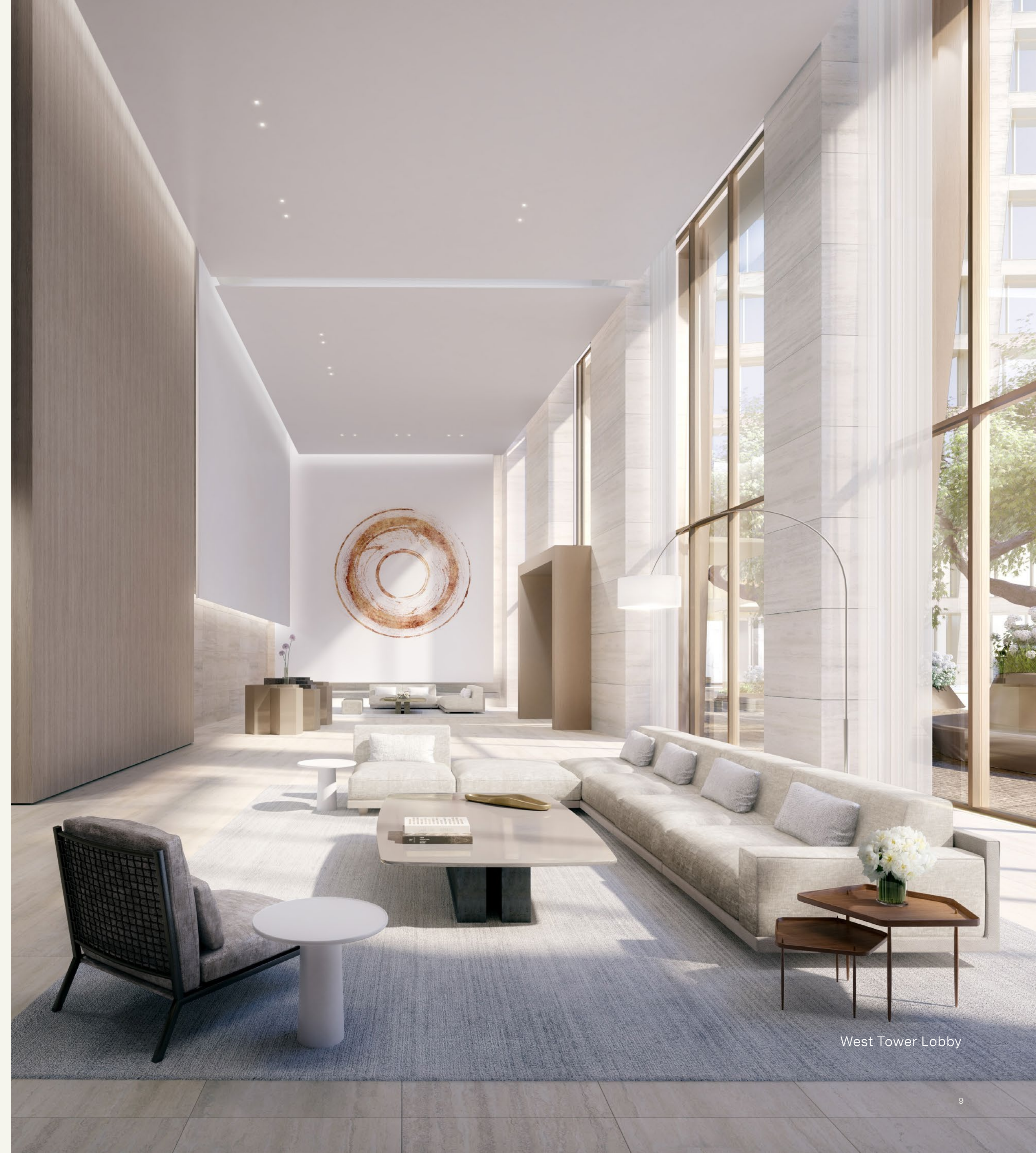
West Tower Lobby