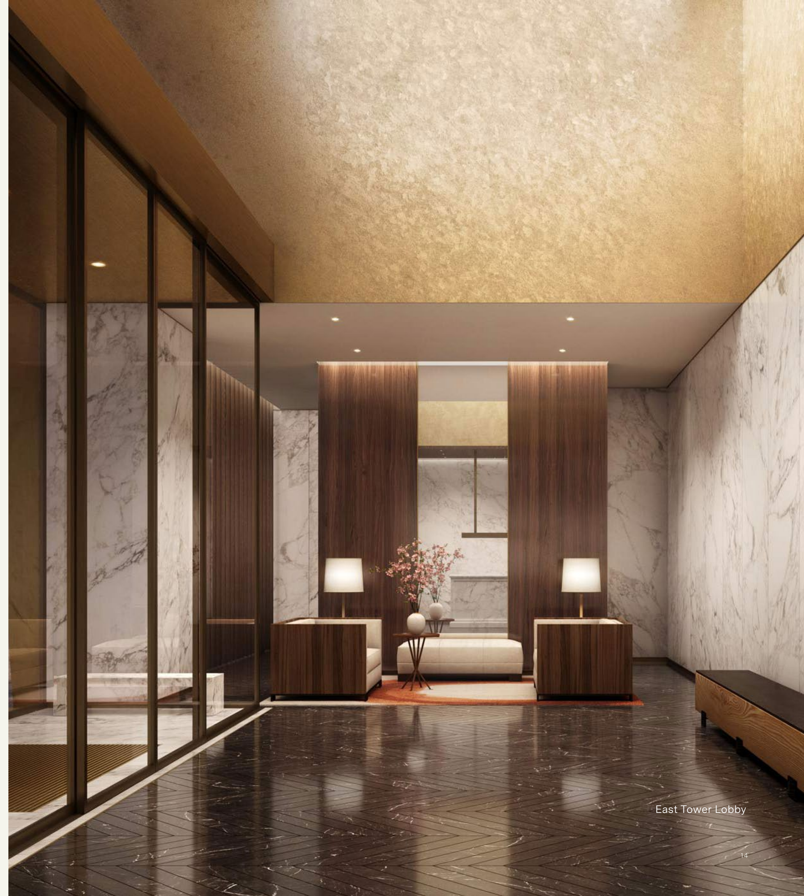
East Tower Lobby