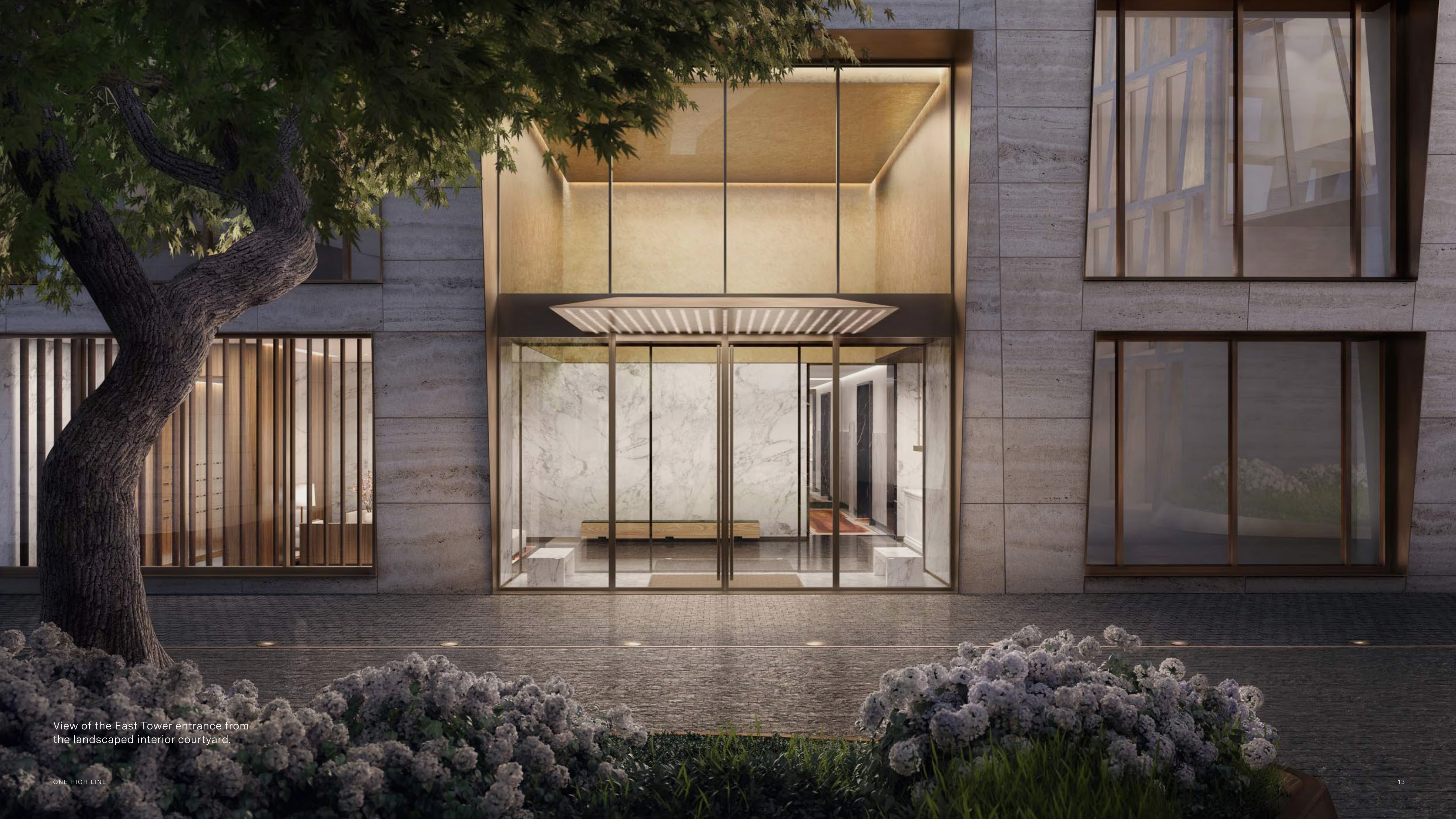
View of the East Tower entrance from the landscaped interior courtyard.