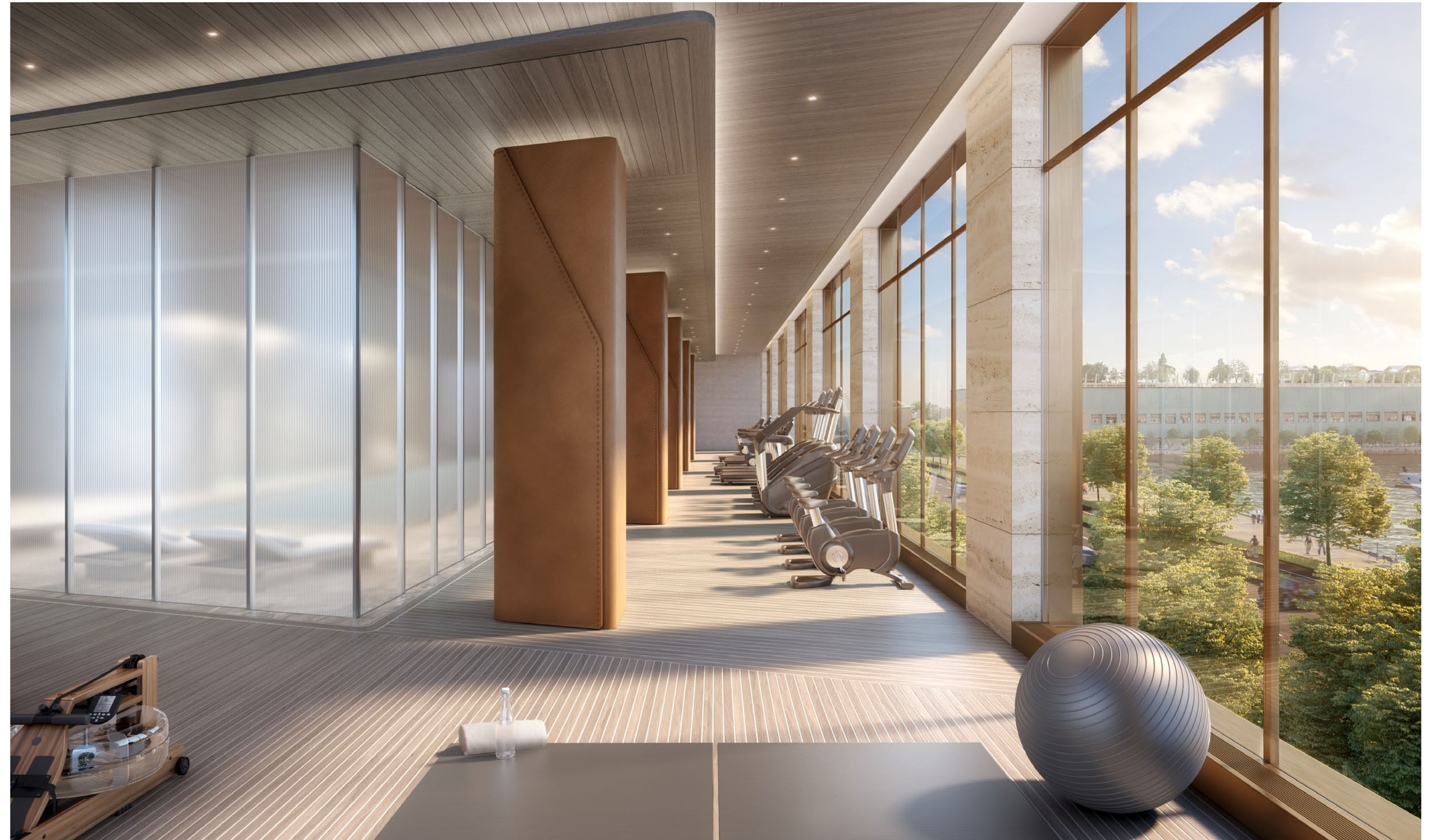
With cutting-edge equipment and private training rooms for one-on-one coaching, the fitness studio offers everything you need and more to maintain your wellness routine.