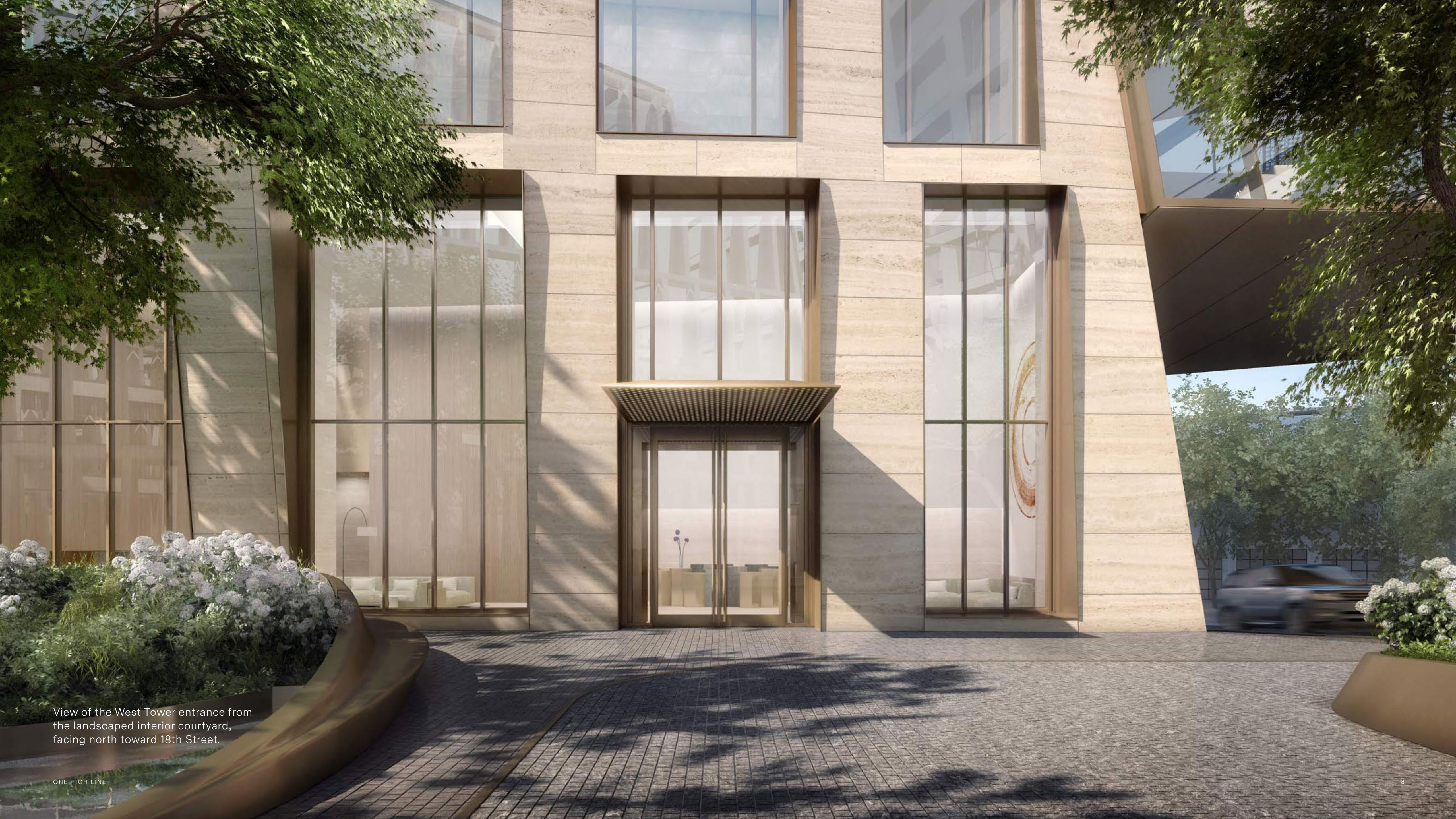
View of the West Tower entrance from the landscaped interior courtyard, facing north toward 18th Street.