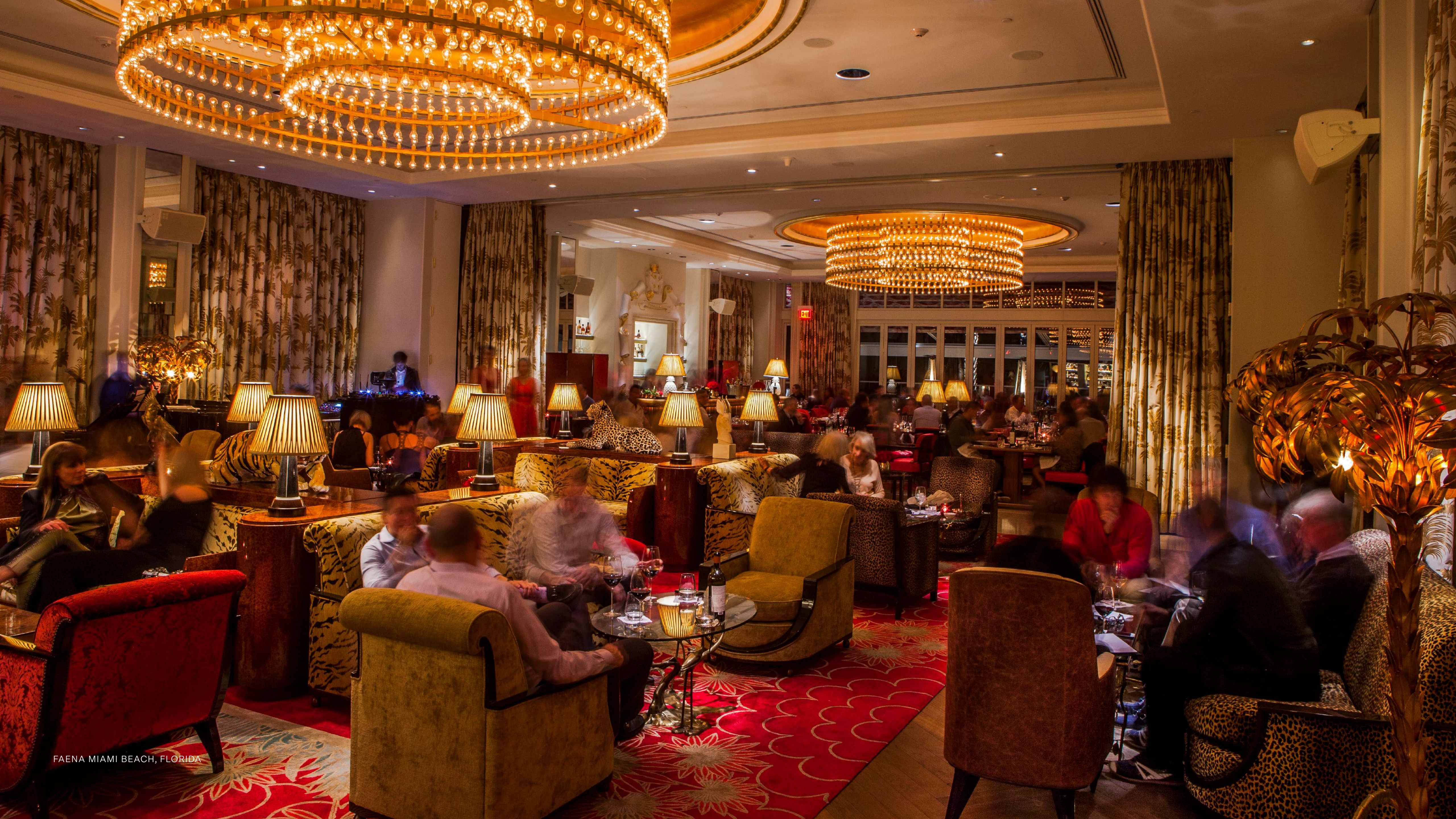
FAENA MIAMI BEACH, FLORIDA