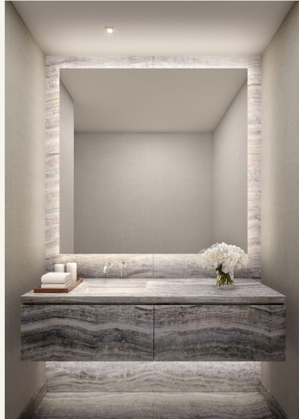
The primary bath is rich in materiality, with quartzite flooring, walls, and bathtubs, satin stainless-steel fitting, and a eucalyptus vanity with polished White Lumix.