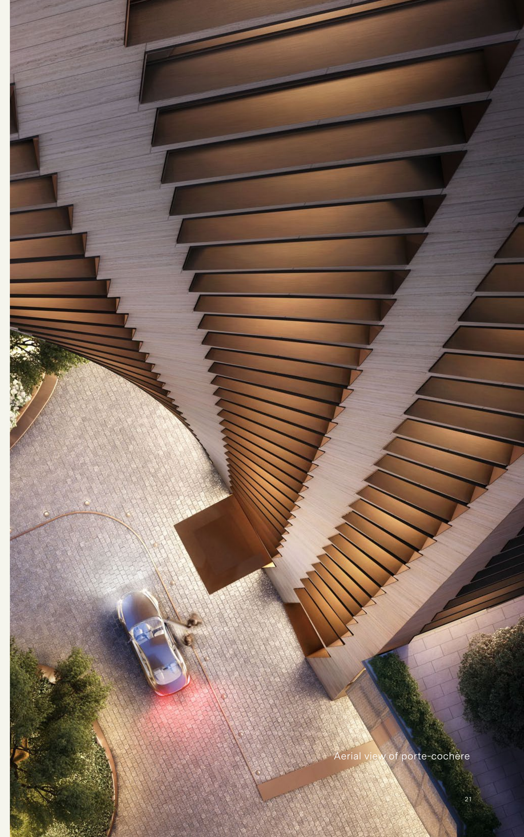
Aerial view of porte-cochère