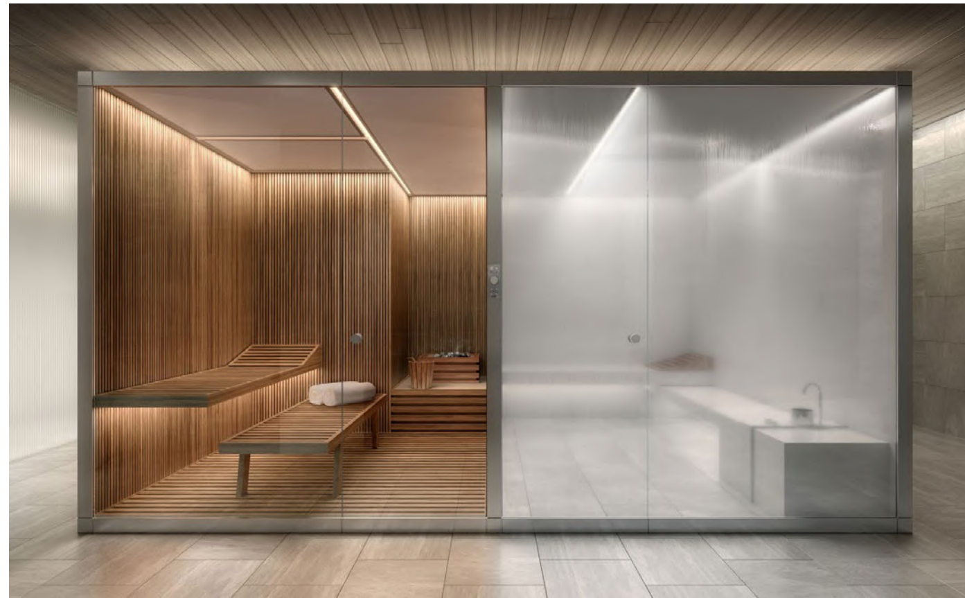
A private treatment room, steam room, and saunas invite restoration and relaxation for the body and mind.